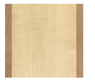
Corpus maple (5184) Lining Havana cherry (R 5681)