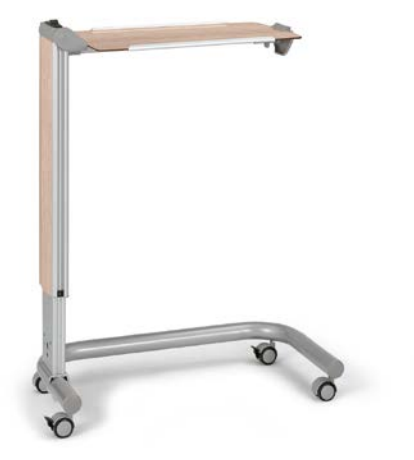
Serving tray Flexible mobility Page 12-13

vt A tried and tested classic Page 10-11