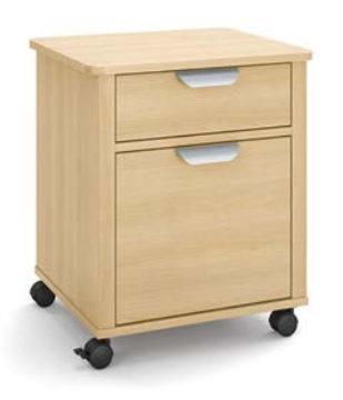
The aluminum handles <sup>1)</sup> give the vivo and vitalia bedside cabinet series their unique design and enable ergonomic access from the bed.

Adapter to easily change the side of the overbed table top without tools (left/right)