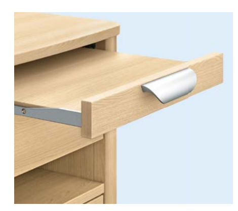
The pull-out tray can be safely locked into place when it is pulled out. It is impossible to unintentionally push the pull-out tray in.