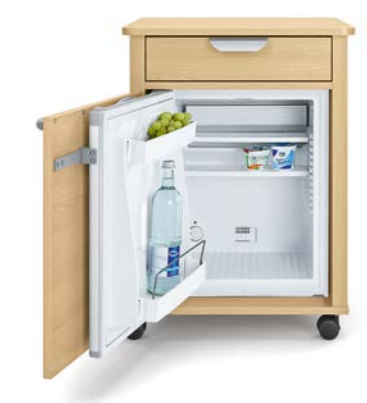
The models with refrigerator have a spacious capacity of 41 I and are suitable for large bottles.