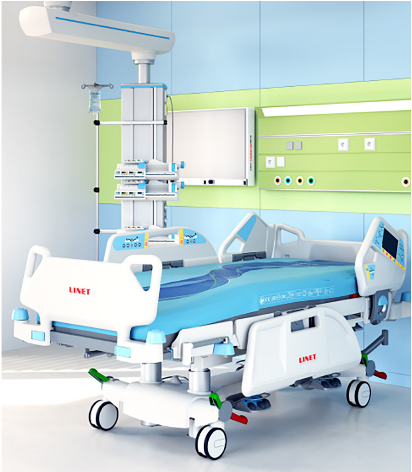
Critical Care Bed