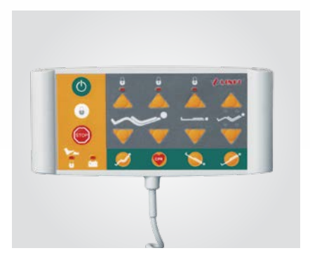
The Supervisor panel for nurses can lock the bed's functions and is equipped with pre-programmed functions.