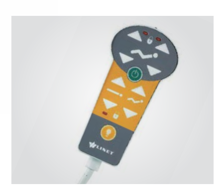
The patient and nurse hand control can adjust the position of bed's mattress platform and height.