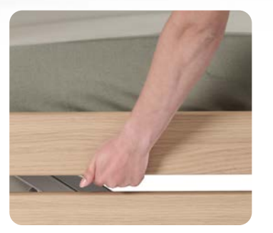
4 | A sophisticated safety concept minimizes the risk of injury and protects from product damage.