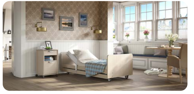
Living concept Cornwall | Design Df