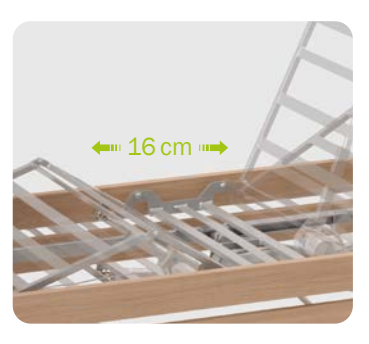
2 | The unique Ergoframe®technology (double retraction) increases the space available in the pelvic area by 16 cm.

3 | The new handset offers automatic care positions, which can be locked and unlocked electronically. The backlighting and clear design round off the product.