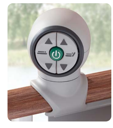
Flexibility and economic efficiency