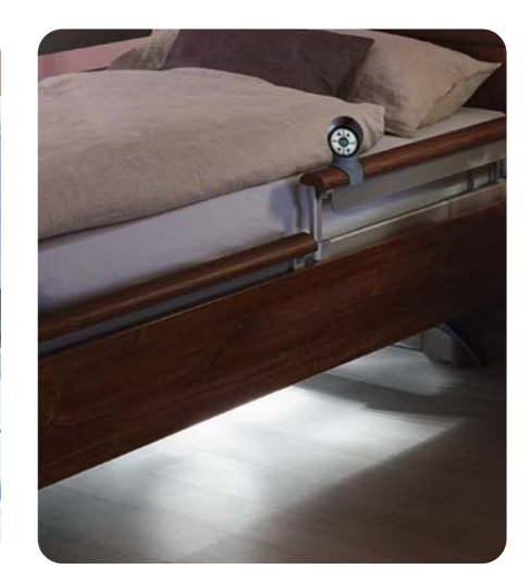
Automatic night light

Thanks to established radio technology, the SafeLift controller can be operated without any fault-prone cables.