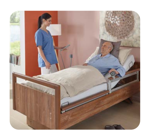
Simple bed operation for residents

SafeLift offers the simplest operation so that residents can adjust their bed independently and set it to the best mobilization position for them. At the same time, they can support themselves when standing up on the SafeLift controller.