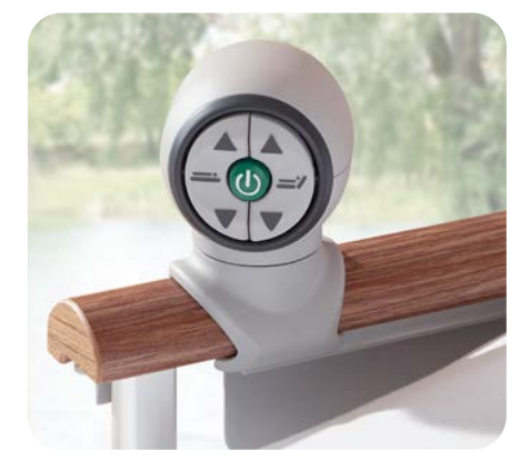
Cable- and battery-free controller