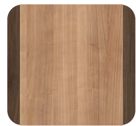
Havana Cherry Okapi Walnut