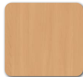
NEW: Altmühl beech (R24006)* 2