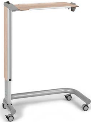
Serving tray Flexible mobility Page 12-13