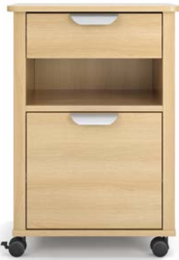
vitalia Robust design with clear lines Page 8-9