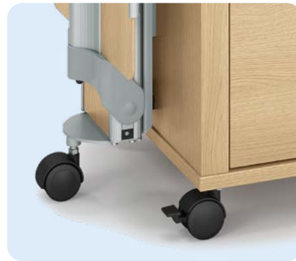
The 5 th castor, which is attached to the mechanism, and the compact design ensure an exceptional stability and load bearing capacity of up to 20 kg of the over-bed tabletop.