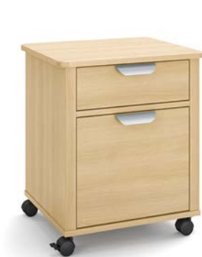
The aluminum handles 1) give the vivo and vitalia bedside cabinet series their unique design and enable ergonomic access from the bed.