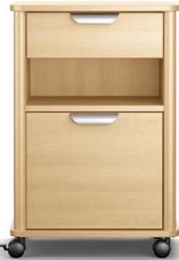
vivo Design meets functionality Page 6-7