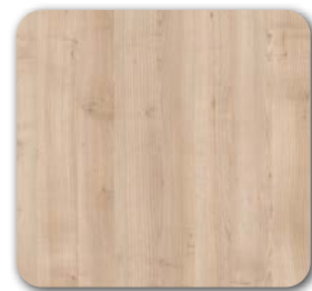
NEW: Norway maple (R27044)* 2