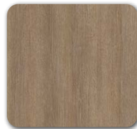
NEW: Italian Oak (R20286)* 2