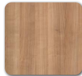
Havana Cherry (R42006)