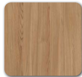
NEW: Salisbury Elm natural (R37016)* 2