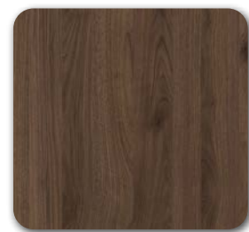
NEW: Okapi Walnut (R30135)* 2