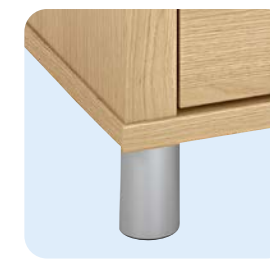
Feet instead of castors