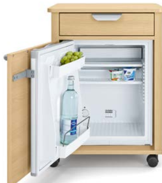
The models with refrigerator have a spacious capacity of 41 l and are suitable for large bottles.