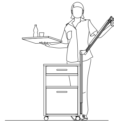
The overbed table is attached to the side and can be easily swung out with one hand, so that the nurse does not have to put the eating tray down.