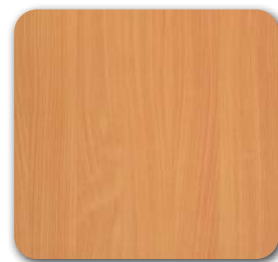
Steamed Beech (R24034)