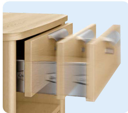
The soft closing drawers are a standard feature 1) that minimize noise and the danger of entrapment.

The use of drawers instead of doors on bedside table models facilitates access from the bed. Special models provide optimal access to the bedside cabinet even for low-maintenance beds. The drawers can be removed without tools and are therefore very easy to clean.