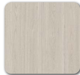
NEW: Nordic Teak (R50094)* 2