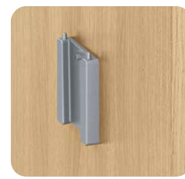
Attachment for mechanical parts