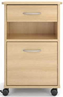
vt A tried and tested classic Page 10-11