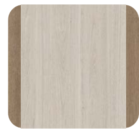
Nordic Teak Italian Oak