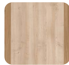
Norway maple Salisbury Elm natural