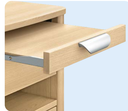
The pull-out tray can be safely locked into place when it is pulled out. It is impossible to unintentionally push the pull-out tray in.

The design is closed on three sides 2) , so it is impossible to push the drawers through to the wall