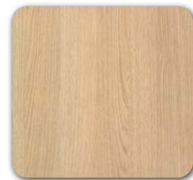
Lindberg Oak (R20021)