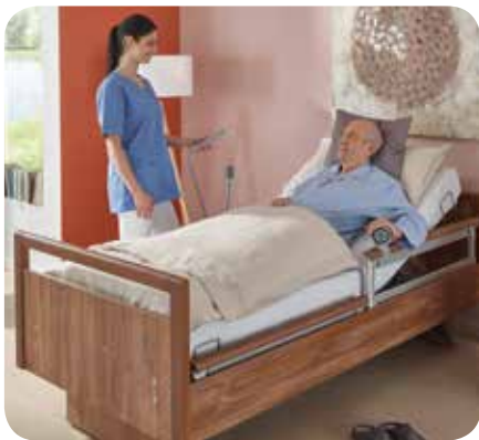
Simple bed operation for residents

SafeLift offers the simplest operation so that residents can adjust their bed independently and set it to the best mobilization position for them. At the same time, they can support themselves when standing up on the SafeLift controller. This promotes residents' self-mobilization, reduces staff calls for bed adjustment and frees up care.