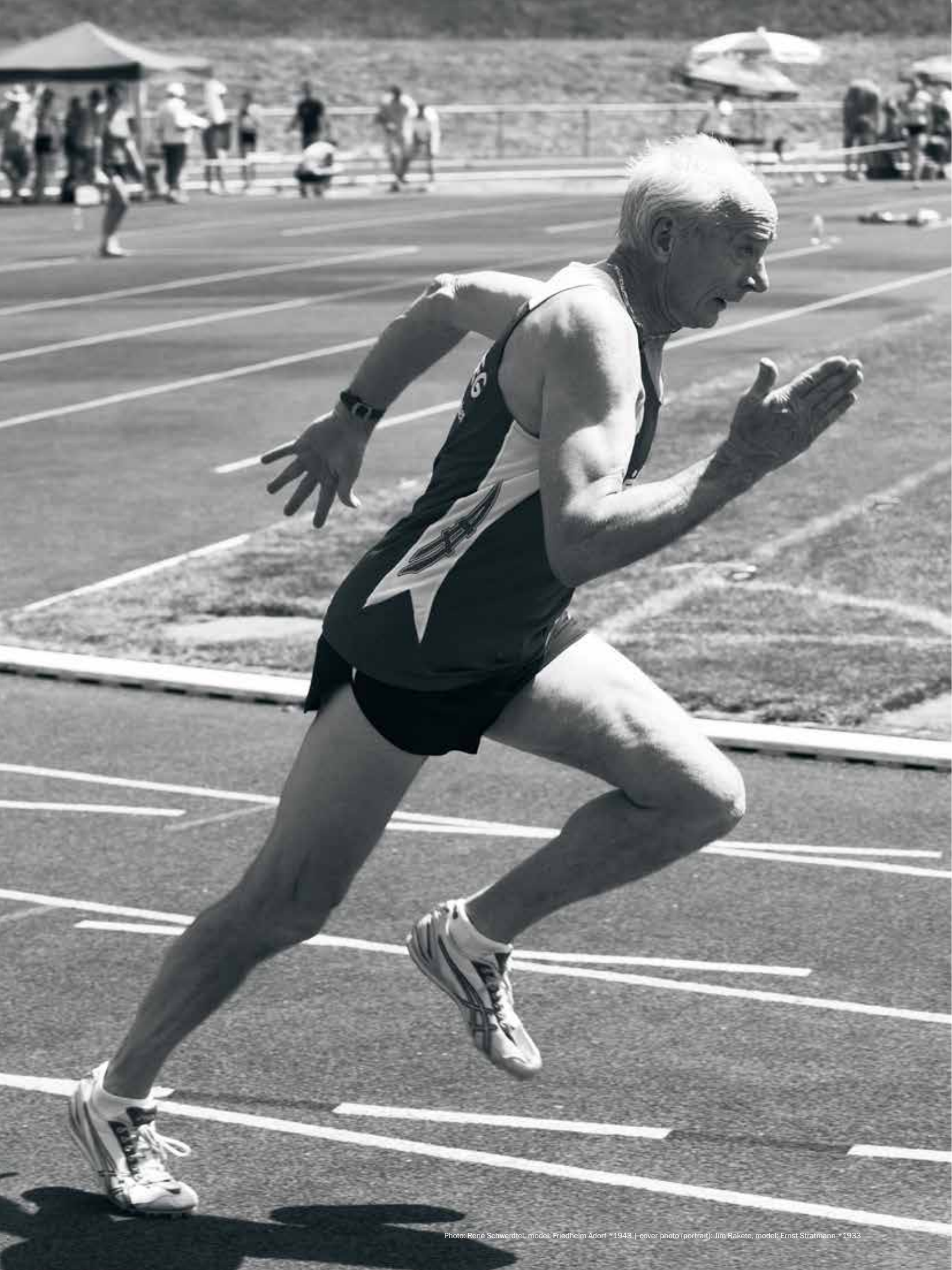
model: Friedhelm Adorf *1943 | model: Ernst Strätmann *1933