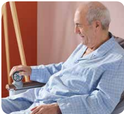
Customized for each resident