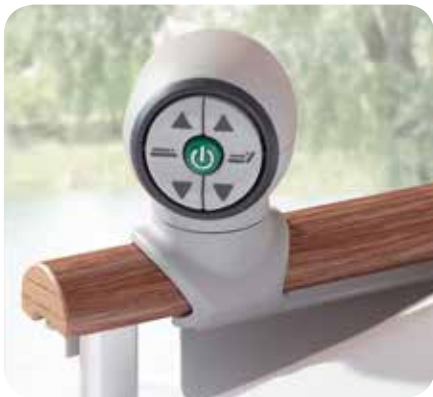
Cable- and battery-free controller