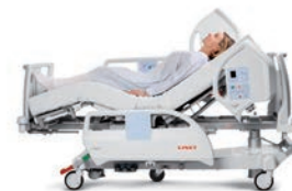
Autocontour with 30° backrest up