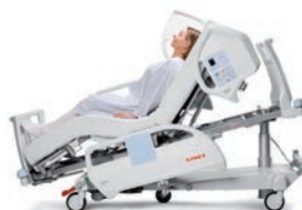
Cardiac Chair position