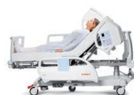
30° backrest stop – Fowler position