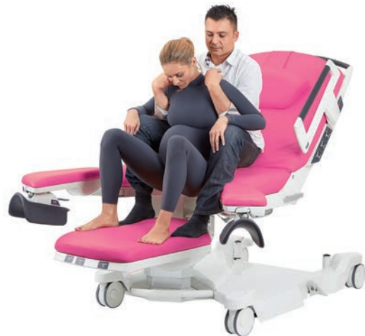
Half sitting with partner assistance