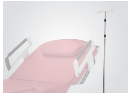
Telescopic infusion stand