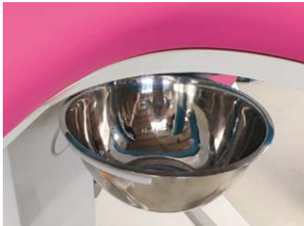
Sliding stainless fluid basin, 8 l