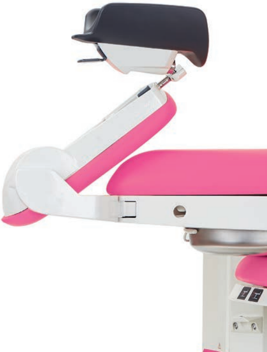
Height adjustment for patients of all sizes.