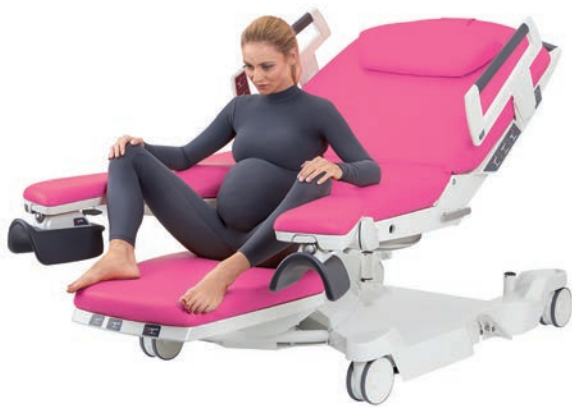
Half sitting using foot section