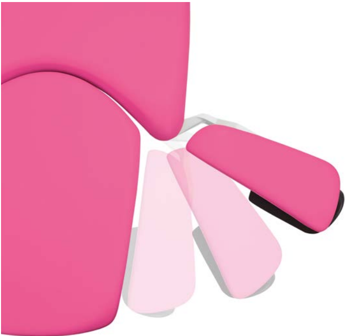
Swing away for improved access.