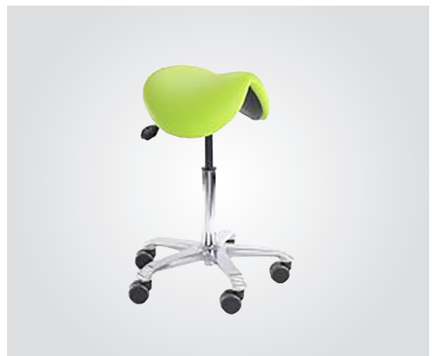
Doctor's chair, ergonomic

(Ask your local LINET Account Executive about available Doctor Chair colors.)