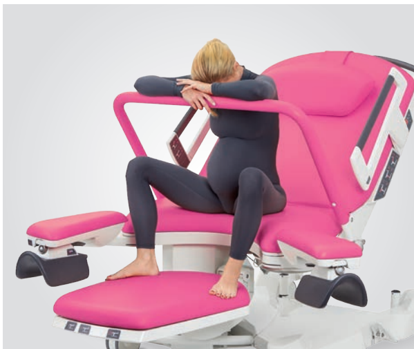
Upholstered support bar