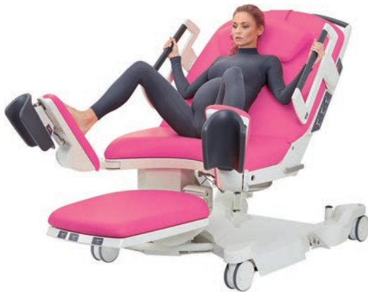
Semirecumbent position with the feet rested on the leg rests