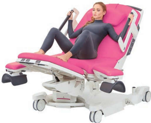
Semirecumbent position with the feet rested on the foot section