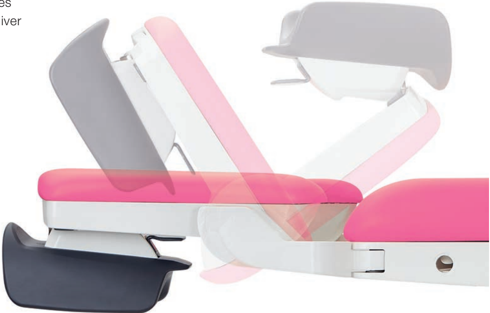
Quick adjustment of the leg rests into the required position.

Rapid configuration with simple and intuitive controls improves efficiency and reduces caregiver frustration.