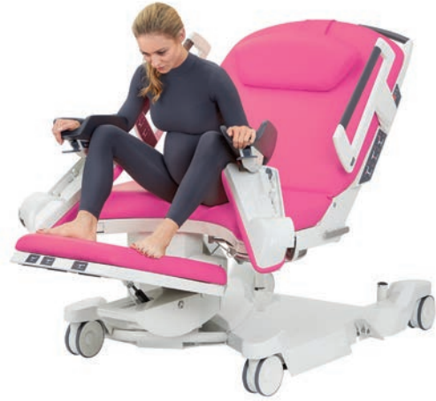
Half sitting using leg holders