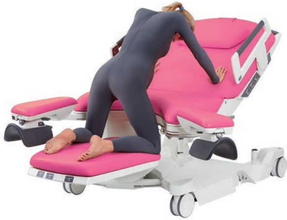
All fours position