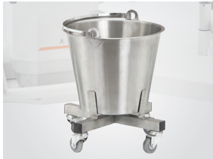
Stainless steel bowl with castors