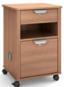
Bedside cabinet vitalia 2