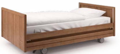
carisma 300-xxl, design G09, 3-part

With the carisma 300-xxl, wissner-bosserhoff combines the established design with sophisticated functions tailored to the care of these residents.