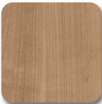
Décor Havana cherry