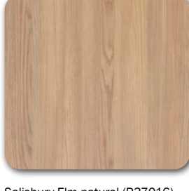
Salisbury Elm natural (R37016)