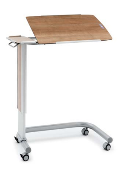
stylo s4-t The lateral tilting function is a comfortable reading or eating support for the resident. Drinks can be put down on a fixed shelf space while the over-bed tabletop is tilted.