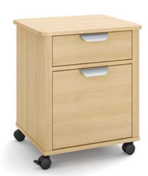
The aluminum handles <sup>1)</sup> give the vivo and vitalia bedside cabinet series their unique design and enable ergonomic access from the bed.