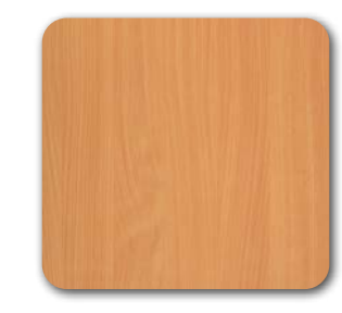
Steamed Beech (R24034)