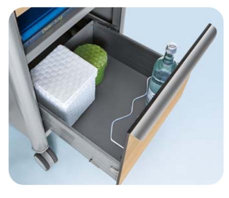
Robust drawers with integrated bottle holder keep things tidy. Throughhandles* guarantee easy accessibility accessibility even from the bed.