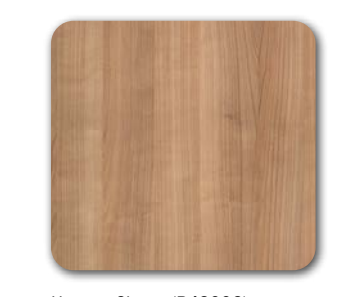
Havana Cherry (R42006)