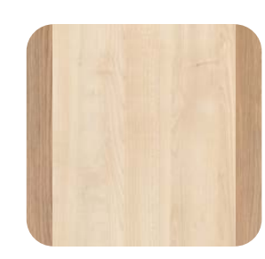
Norway maple Salisbury Elm natura