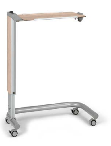
stylo s3 The overbed table is height adjustable and can be tilted. It also has the flexibility to be adjusted for different purposes such as when eating, or to provide support for activities such as reading.

The serving tray is extremely mobile, making it a practical aid in daily nursing care. It can be pushed up to the bedside cabinet, the bed or armchair, transport chair and wheelchair as needed. It is mainly used as a table replacement. The practical one-handed operation is also a very useful feature.