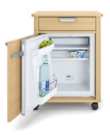
The models with refrigerator have a spacious capacity of 35 I and are suitable for large bottles.