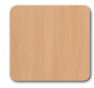
Altmühl beech (R24006)