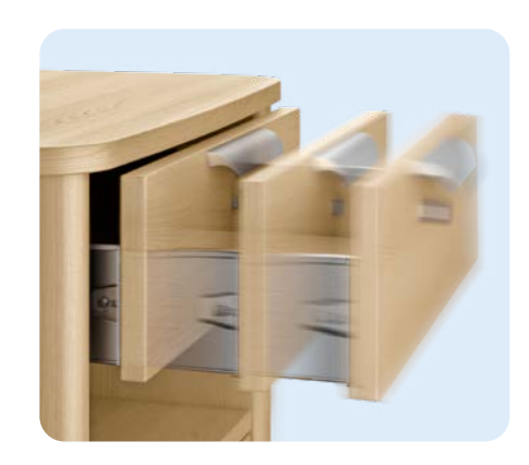
The soft closing drawers are a standard feature<sup>1)</sup> that minimize noise and the danger of entrapment.

The use of drawers instead of doors on bedside table models facilitates access from the bed. Special models provide optimal access to the bedside cabinet even for low-maintenance beds. The drawers can be removed without tools and are therefore very easy to clean.