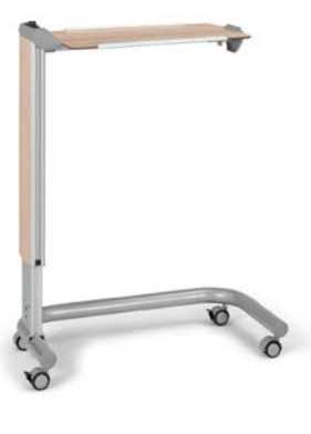
Serving tray Flexible mobility Page 14 - 15