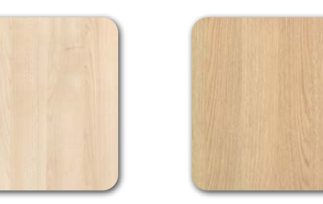
Lindberg Oak (R20021)