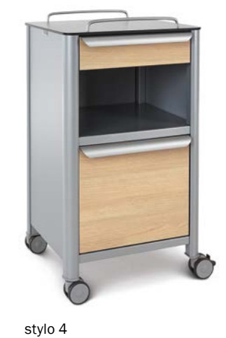
The light version (LE) of the stylo series has narrower outer dimensions, which simplifies the handling of the bedside table. The bedside table top is fixed, but still usable on both sides.