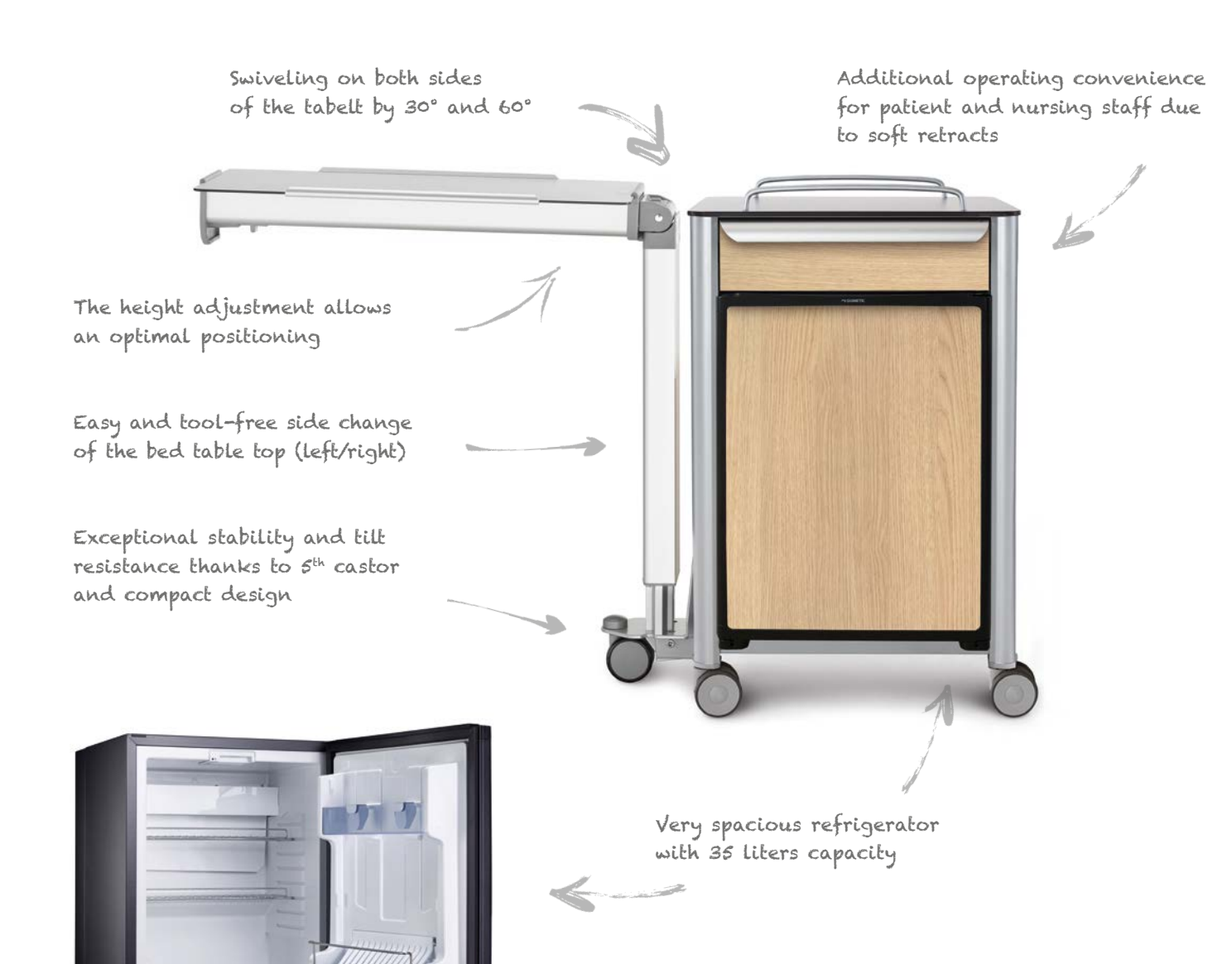
Higher product features provide further storage space and an additional intermediate compartment