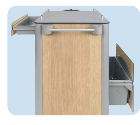
The design of the LE variant enables double-sided use thanks to slide-through drawers.