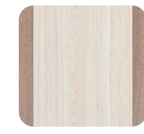
Nordic Teak | Italian Oak