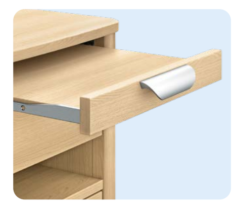
The pull-out tray can be safely locked into place when it is pulled out. It is impossible to unintentionally push the pull-out tray in.