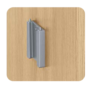
Attachment for mechanical parts