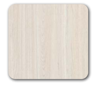
Nordic Teak (R50094)