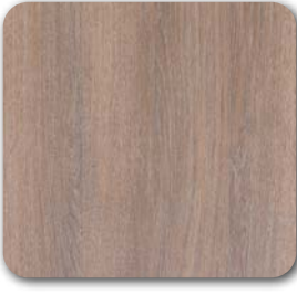
Italian Oak (R20286)