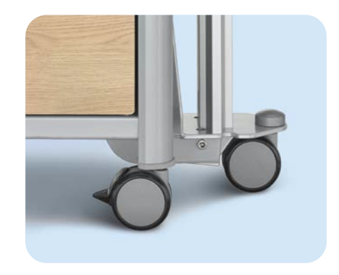
The compact design and the separate 5<sup>th</sup> castor in the version with dining tray support fall prevention thanks to their exceptional stability and tilt resistance.

The stylo bedside table series combines a homely furniture design with innovative functions. The surfaces used allow for easy and thorough cleaning of the bedside tables to ensure the highest hygiene standards. Robust drawers with integrated bottle holders keep things tidy. Full-length handles guarantee easy accessibility even from the bed.