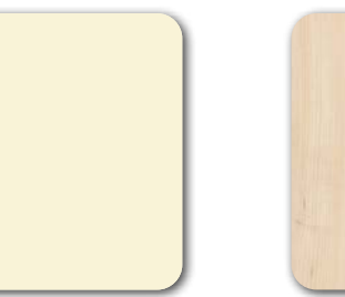
Norway maple (R27044)