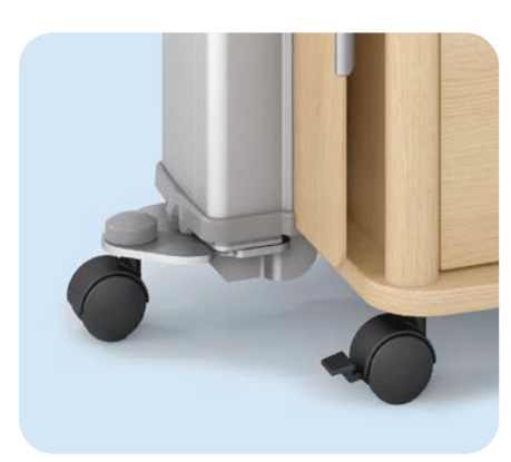
The 5th castor, which is attached to the mechanism, and the compact design ensure an exceptional stability and load bearing capacity of up to 20 kg of the over-bed tabletop.