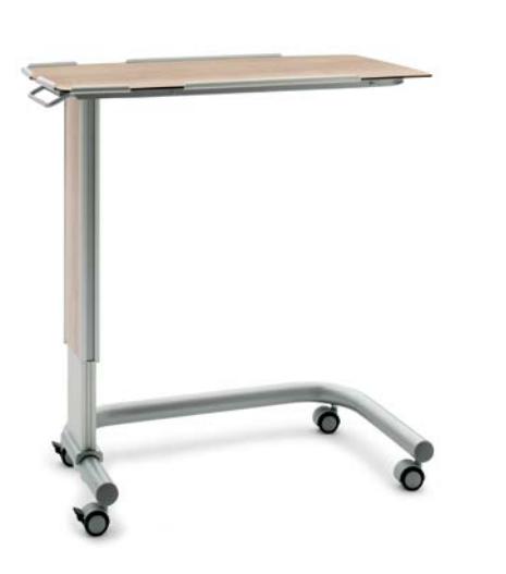
stylo s4 The larger overbed table also increases the comfort for patients who cannot leave the bed. Thanks to the fixed over-bed tabletop, the s4 serving tray is extremely stable.