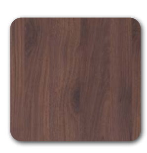
Okapi Walnut (R30135)